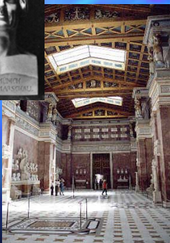
Walhalla bei Regensburg

Walhalla near Regensburg build 1842 to honour important Germans (mainly writers and poets). Muennich was honoured there for his work as a Russian General not as a hydraulic engineer